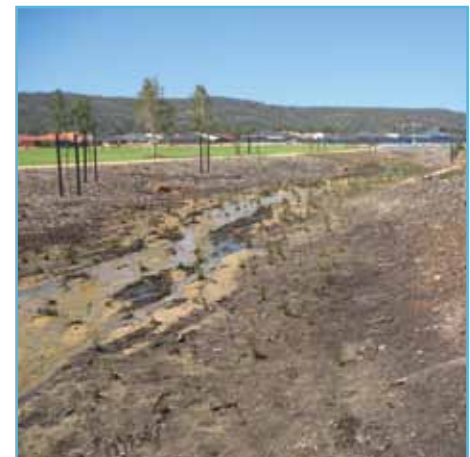
Newly constructed living stream, Byford