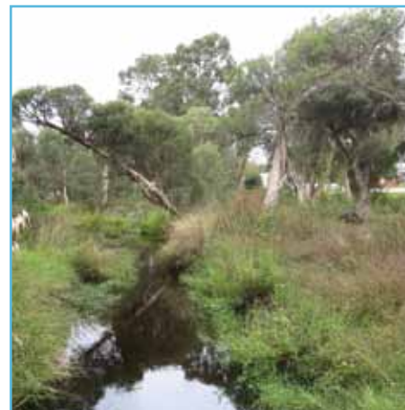
Bannister Creek drain retrofit, Lynwood