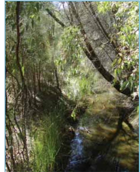
Garvey Park drain retrofit, Ascot

The effectiveness of living streams in removing pollutants varies greatly depending on the nature and type of systems. The location and density of vegetation is a particularly important factor.