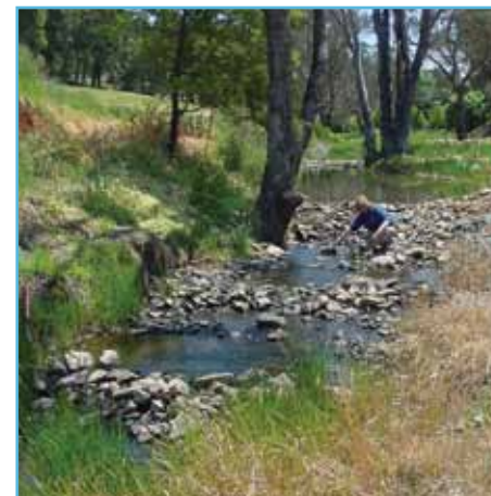
Geegilup Brook drain retrofit, Bridgetown